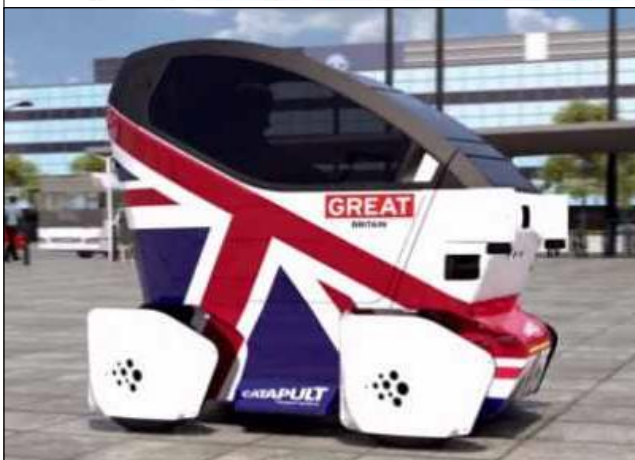
Driverless car: Lutz Pathfinder pod

All Roads Lead... to British Car Week British Car Awareness Week A Show For The Road Drive Your British Cars! May 30 - June 7, 2015 We Hope To See You On The Road!