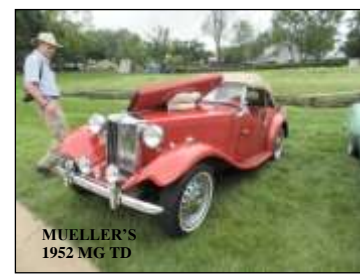
MUELLER'S 1952 MG TD