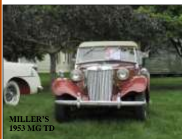
MILLER'S 1953 MG TD