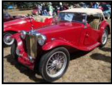
MALCOLM C. CASTLE March 11, 1935 - July 11th, 2015