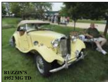
RUZZIN'S 1952 MG TD