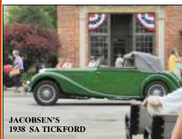
JACOBSEN'S 1938 SA TICKFORD