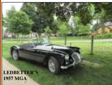
LEDBETTER'S 1957 MGA