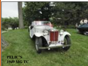
PELIC'S 1949 MG TC