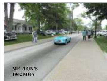
MELTON'S 1962 MGA