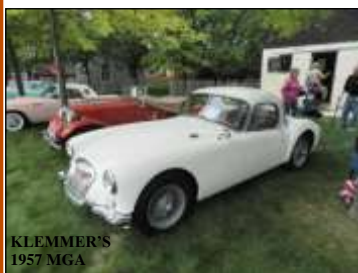
KLEMMER'S 1957 MGA