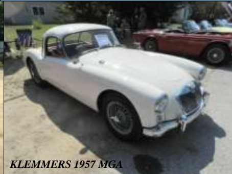
KLEMMERS 1957 MGA