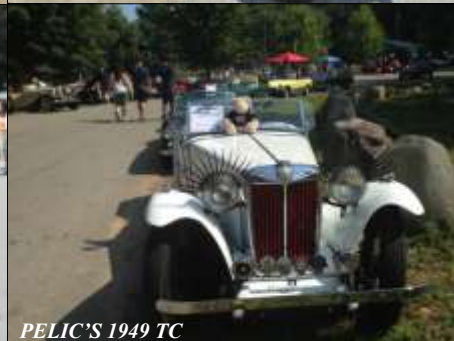
PELIC'S 1949 TC