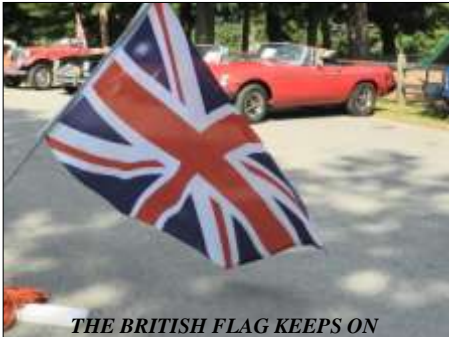
THE BRITISH FLAG KEEPS ON