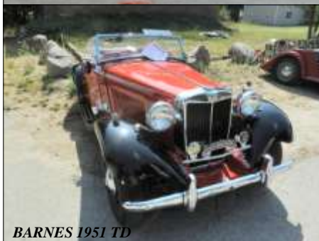
BARNES 1951 TD