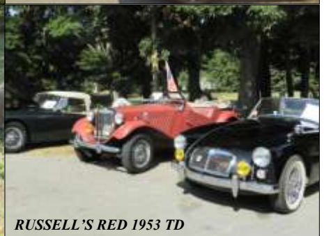
RUSSELL'S RED 1953 TD