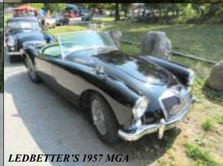
LEDBETTER'S 1957 MGA